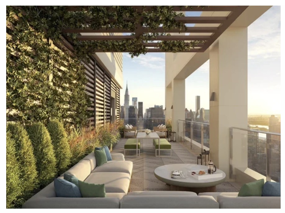
VU's terrace offers some respite away from the busy pace of New York life down below