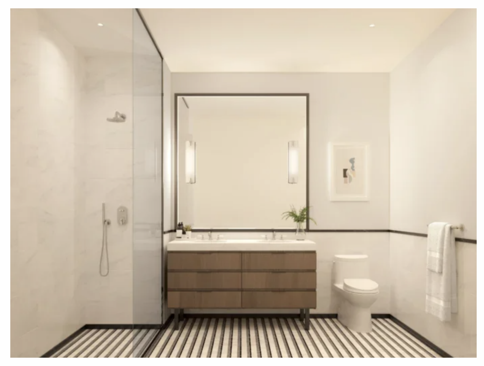
Paris Forino's custom line of faucets and fixtures for Waterworks was designed exclusively for these residences