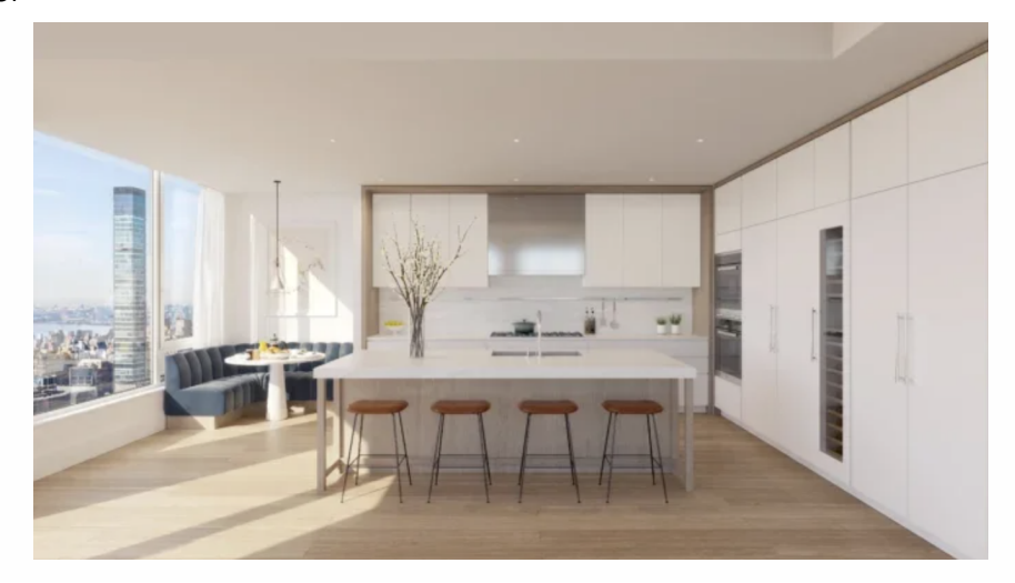
The penthouse kitchen feels bright and airy thanks to the neutral color palette and expansive windows