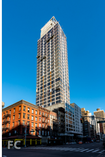
Southeast corner from Third Avenue.

Facade installation is nearing completion at Minrav Development's 36-story residential condo tower the VU at 368 Third Avenue in the Kips Bay neighborhood of Manhattan. Designed by SLCE Architects, the tower's facade features a glass window wall with a grid of faceted metal panel slab and pier caps. Bronze colored metal panel accents complement the tower's mullion color.