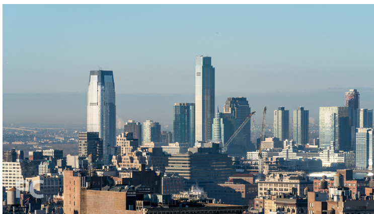
View southwest towards the Jersey City waterfront.