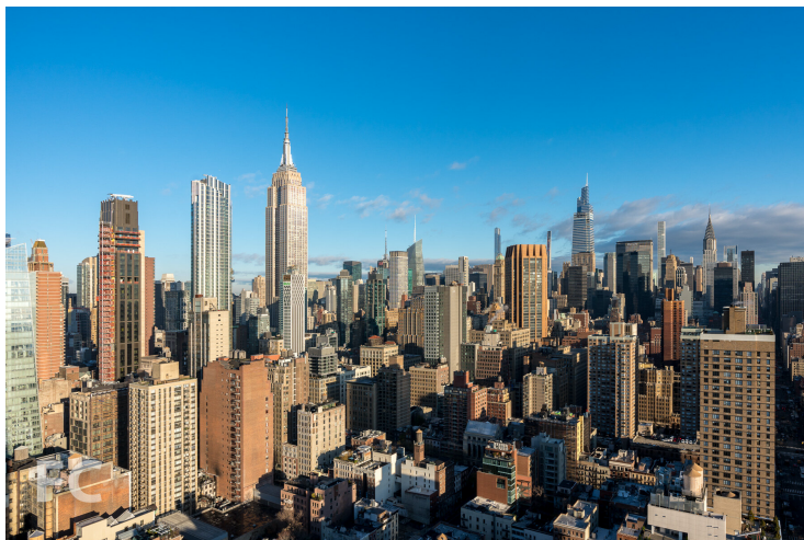
View northwest towards Midtown.