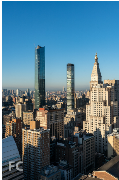
View southwest towards NoMad.