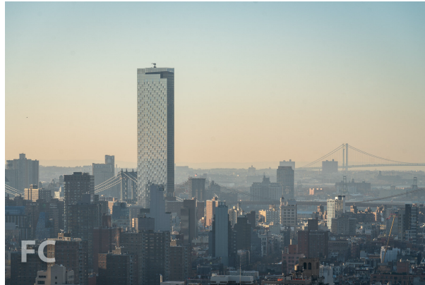
View southeast towards the Lower East Side.