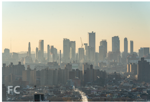
View southeast towards Downtown Brooklyn.