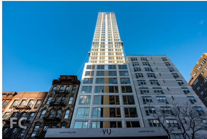
Looking up at the east facade from Third Avenue.