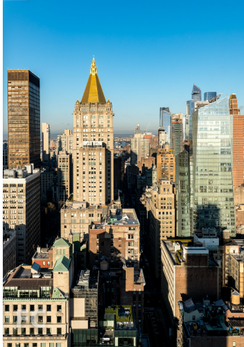
View west towards NoMad and Hudson Yards.