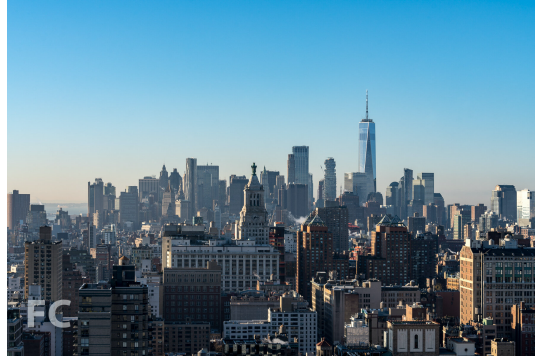
View south towards Lower Manhattan.